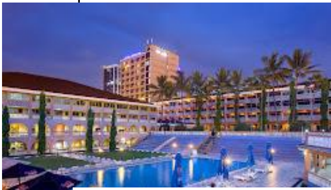
26-NTCE exhibition venue @ Hotel Africana, poolside